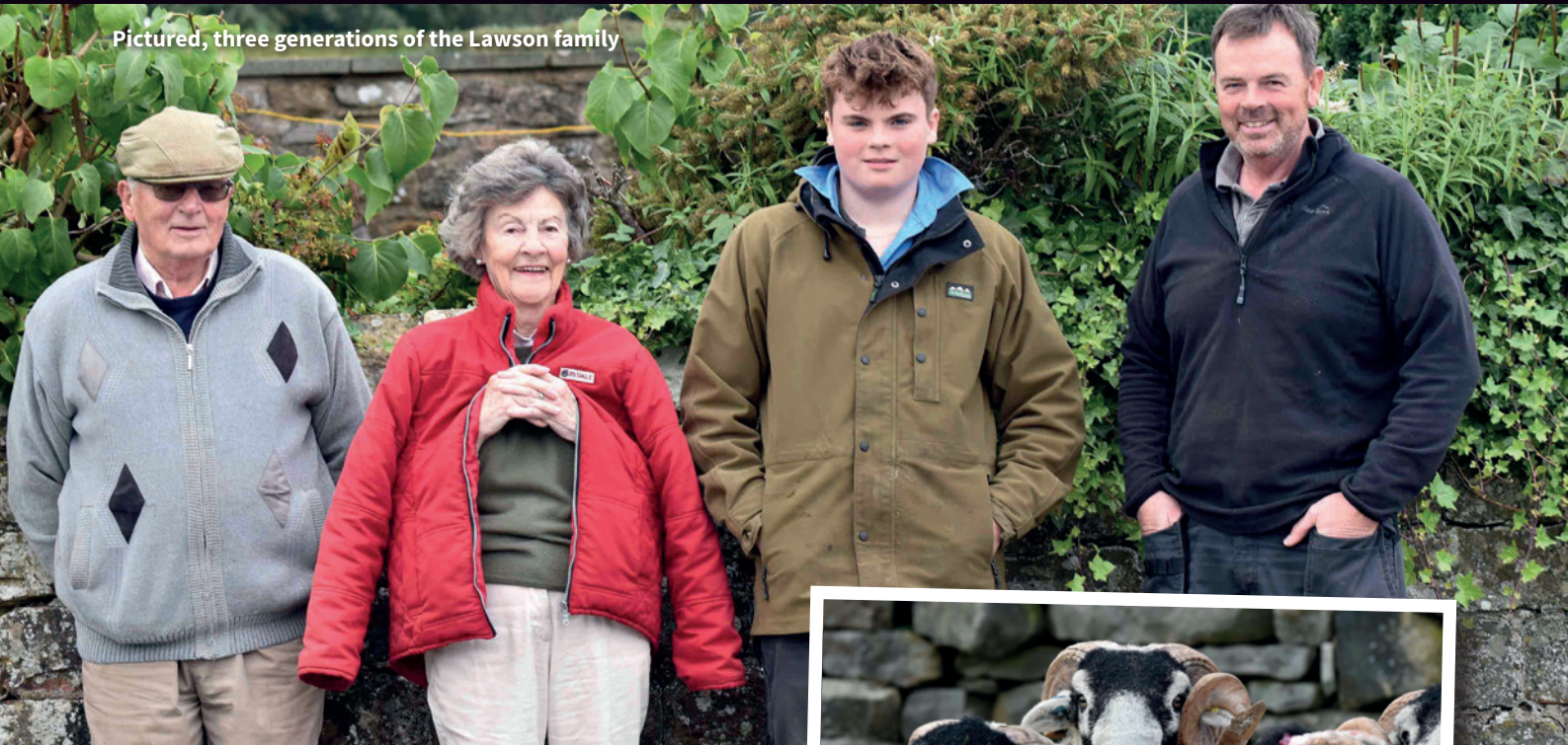
Pictured, three generations of the Lawson family

She may be known as the ‘Queen of the Hills’ but she’s still got to earn her keep and it’s no different for the Swaledale ewes at Buddle House whose Texel-sired offspring have been used to build a prolific and, just as importantly, profitable flock for some years now.