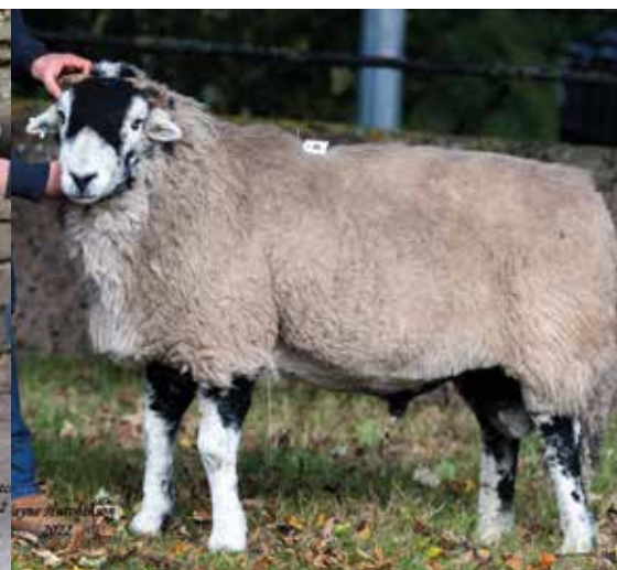
Top priced aged ram from Ms White, Bland and Dixon sold for £5,200 to M & K Emmott, Whitelees