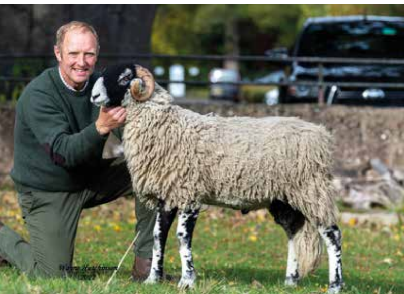
Burncroft Farm, Champion sold for £2500 to SR Taylor, Ellerbeck

Burncroft Farm 18000, 2500, 4500, 800, 1200, 1600, 14000, 700, 6000, 600