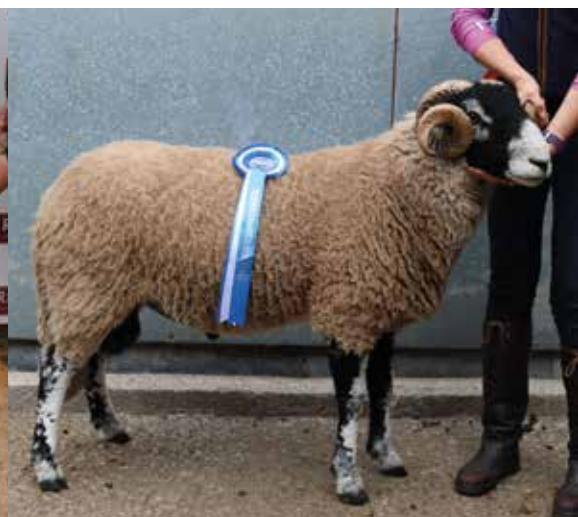
Sally Snaith, 1 st Small Breeder and Reserve Champion sold for £780 to P Turnbull