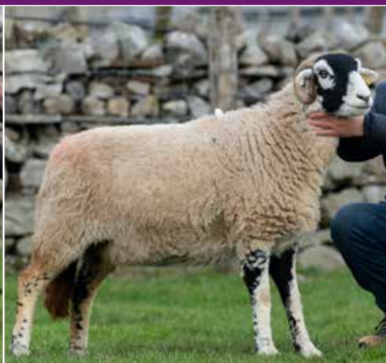
KG Sowerby, High Croft sold the 4 th Prize Ewe for £2,100