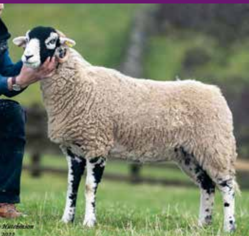
KG Sowerby, High Croft sold this shearling for £5,000 to Burncroft Farms.