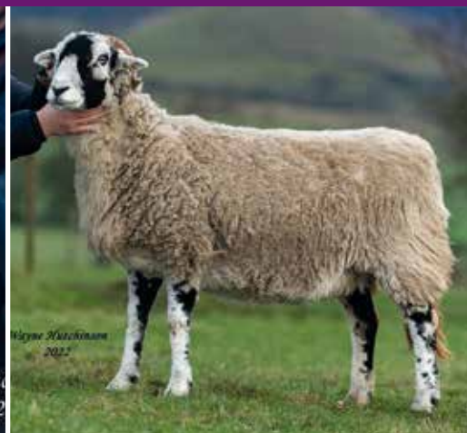
KG Sowerby, High Croft sold this ewe for £4,200 to E Haughey and PE&KA Sowerby.