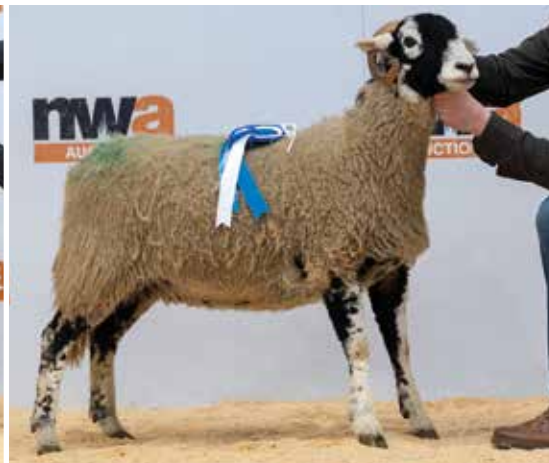
Reserve Champion, from A&M Skidmore, Flakebridge sold for £1,300 to Max Hutchinson