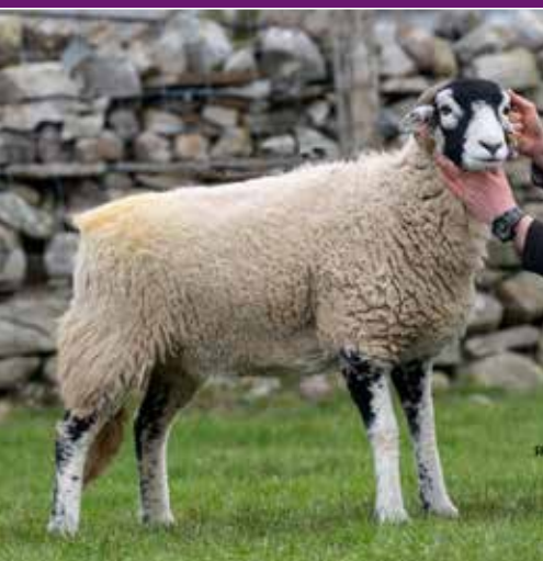
Reserve Champion, 2 nd Prize gimmer Shearling from PE&KA Sowerby, Oakbank sold for £900