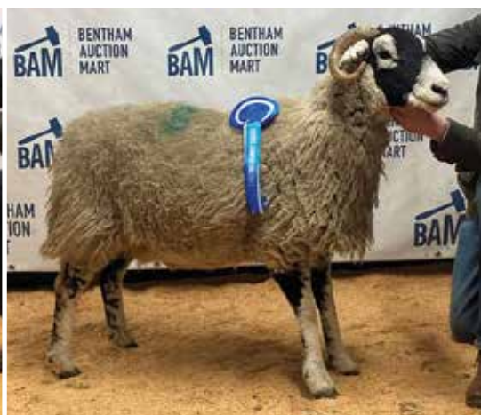
Reserve Champion, from A&M Skidmore, Flakebridge sold for £500 to J Coates.