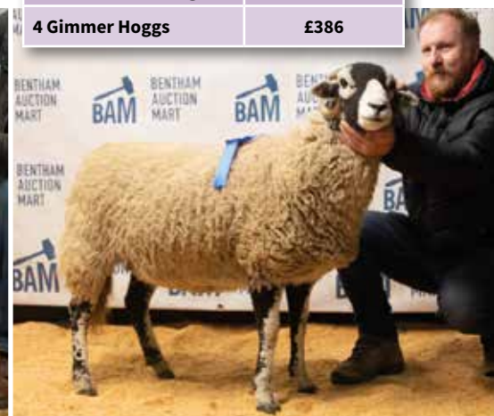
2 nd Prize ewe from KG Sowerby sold for £1,000 to M Alpe