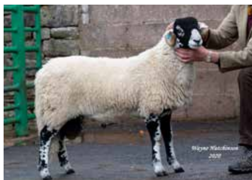
Left: Top priced aged ram from I Collinson, Billing Shield -£8,000